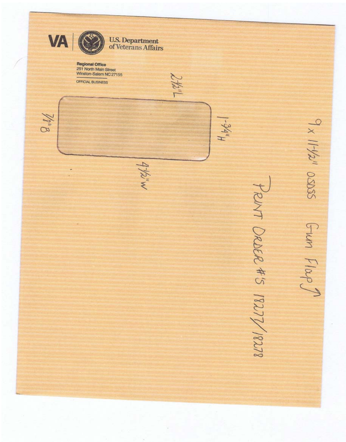
Exhibit C (Custom White Envelope—reduced from actual finished size)